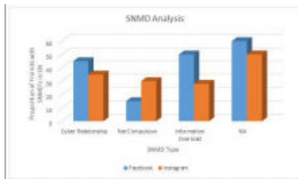
Fig 2: SNMD Analysis

SNMD Analysis: In analysis, author applies the SNMD algorithm on large scale Online Social Network (OSN) datasets like Facebook and Instagram. Author analyzes the SNMD different cases between friends of SNMD. According to among CR users (cyber relationship), about 45 percent of their users (friends) are also in CR.